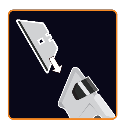
4. Slide in a new blade.