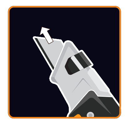
3. Pull the blade out of the front of the knife.