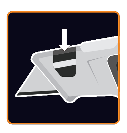
5. Push black lock down until it clicks.