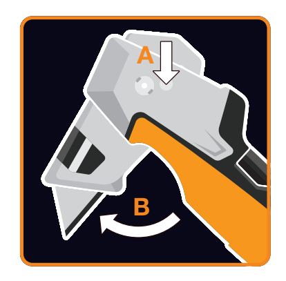
Press the button on the side of the knife (A) to flip knife to open position (B)

CAUTION: For your protection wear gloves, as well as ANSI-approved safety glasses during this operation.